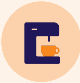
Coffee machines and water fountains