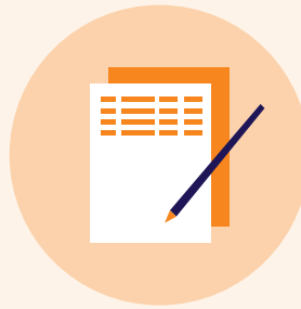
Common pens for sign-in sheet to construction site