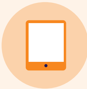
Screens and tables should be wiped after use, including iPads, photocopiers, digital check-in scanners and desktop stations