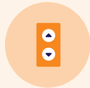
High-touch public surfaces Stairwell handrails, door handles, tabletops, lift buttons, microwaves and other kitchen surfaces