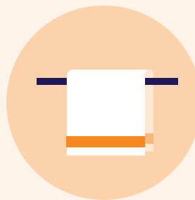
Wash items Towels, tea towels and other fabrics and dry thoroughly outside or with a dryer